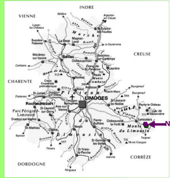
Department of Haute-Vienne - Region of Limousin